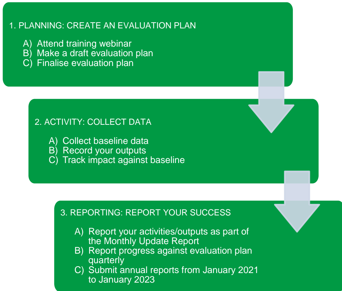
Figure 1: Key tasks for evaluating your challenge fund project